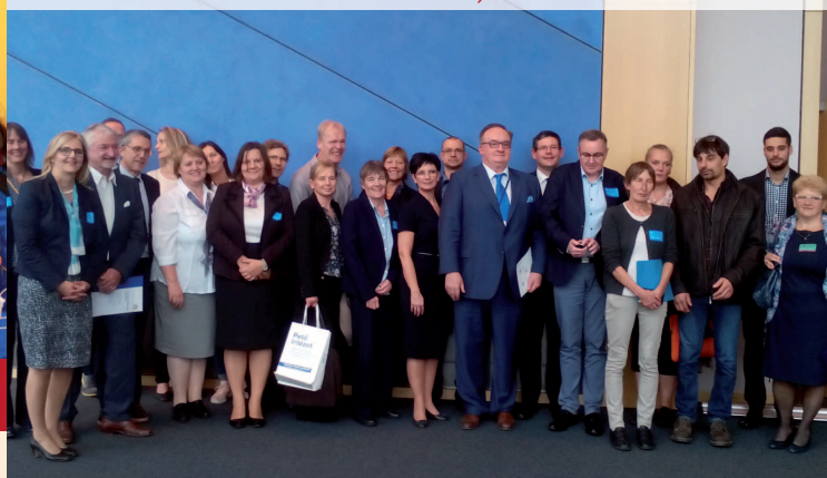
Hospitation of EVHN Nürnberg students, Munich 2018