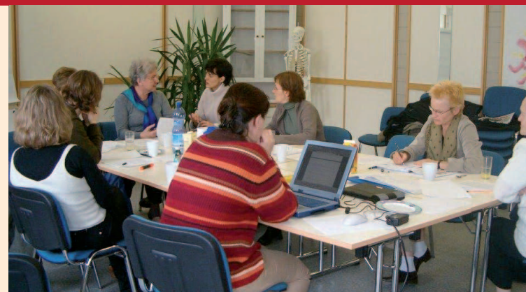
Founding session of ECA, Vienna 2004