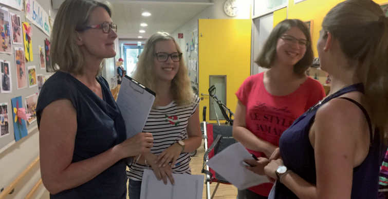
German conductor students hospitation at Phoenix Schulen und Kitas GmbH, Germany

At the same time it must also become common know- ledge that CE can serve as a pedagogical concept with focus on movement, sports and music for the education of any child, disabled or not, from toddlers age onwards up to adolescence.