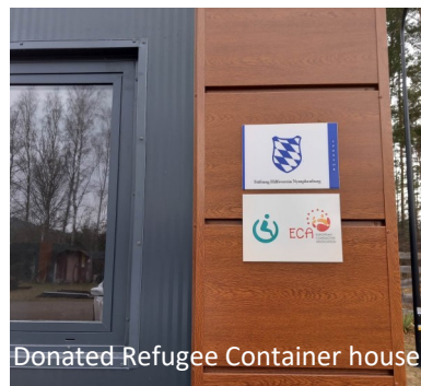
Donated Refugee Container house

December 2022, representatives of the ECA and Pfennigparade participated in the form of an online Charity Evening entitled Together for Hope, during which the Association raised funds to further help Ukraine. The guests from Ukraine present at the event expressed their heartfelt thanks for their help. Five families currently live in the cottages. 10 children with disabilities attend the Association's special school. Housing, food and other needs are paid for with funds from the Polish government, the State Found of Rehabilitation and the Rotary Club of Hanau.