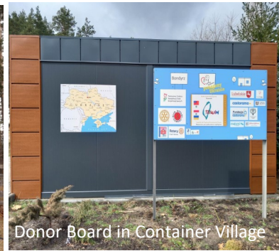
Donor Board in Container Village