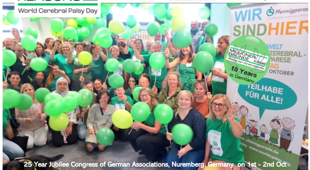
25 Year Jubilee Congress of German Associations, Nuremberg, Germany on 1st - 2nd Oct