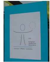
1 st Logo Design 2004

ECA is an umbrella organisation uniting conductive institutions to collectively work for the recognition and spread of CE. The ECA has taken leadership of CE and we work together with the András Petö Faculty to achieve our common goals in the areas of awareness, recognition, quality and training.